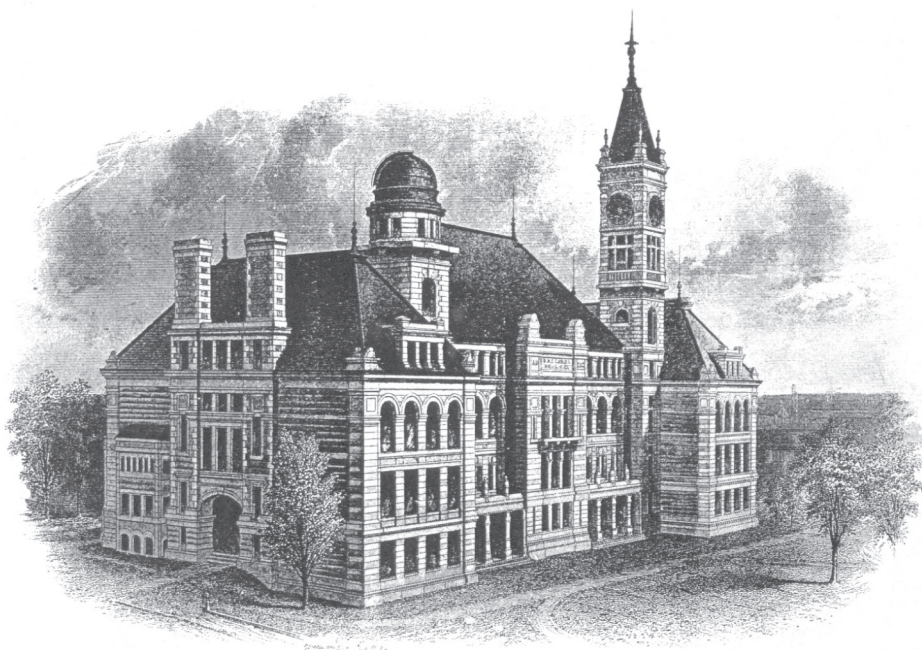
B. M. C. Durfee High School, Fall River, Mass. DEDICATED JUNE 15, 1887

Raise our praises high to Durfee, Alma Mater dear. Tow'ring high beside the river, Radiant beacon clear.