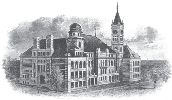
B.M.C. Durfee High School, Fall River, Mass. DEDICATED JUNE 19, 1887